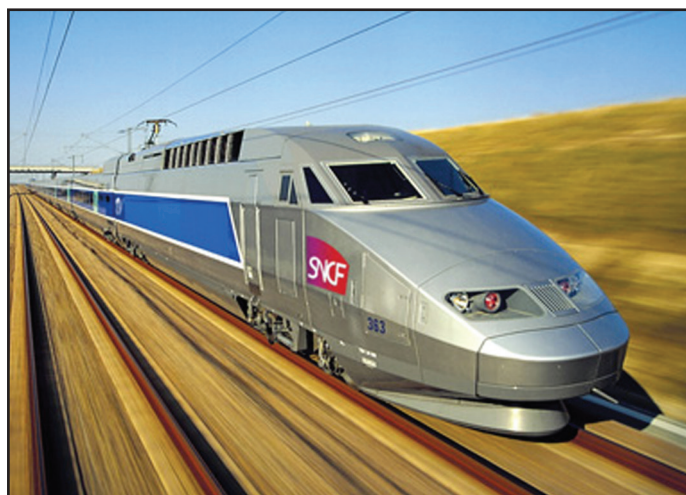
A TGV train on a high-speed track in France

Studies have shown that travel by rail can be faster than air travel for short journeys. For example, the introduction of a high speed rail link between Brussels and Paris has reduced door-to-door travel times by around 50% compared to air travel. For business travellers, rail is more convenient because it minimises disruption to the working day. The combination of speed, safety and convenience result in increased economic activity and sustainable transport.