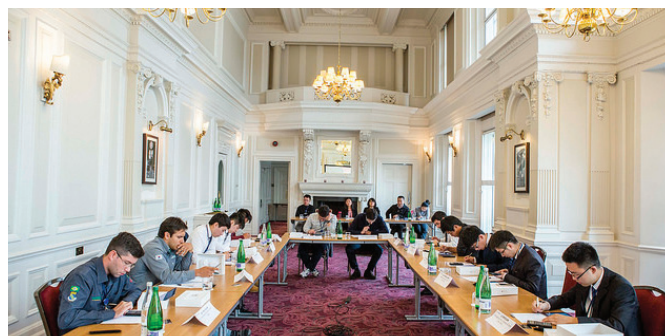
steelChallenge-10, London, April 2016

Annual highlights include steelManagement (a four-day residential course on steel business strategy) and steelChallenge (a global competition for young people using a manufacturing simulation).