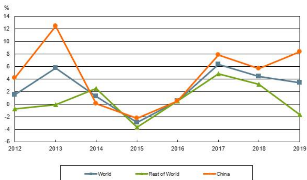
Crude steel production annual growth trend

Oceania produced 6.1 Mt, down 2.9% on 2018.